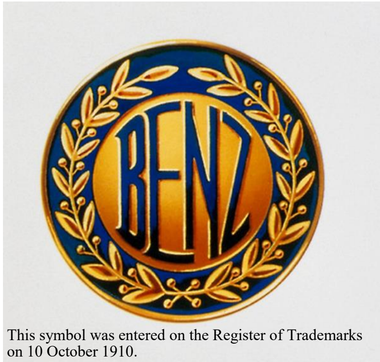
This symbol was entered on the Register of Trademarks on 10 October 1910.

It was from these beginnings that one of the world's most recognized trademarks still used to this day was developed.