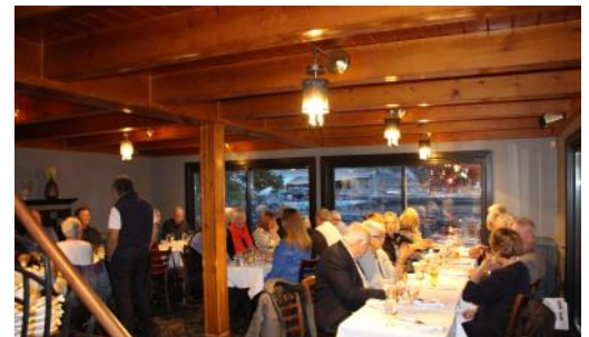
Enjoying dinner at AGM

It was mentioned that the next annual planning meeting will be held on March 7th. This meeting allows members to provide their suggestions on what sort of events they would like to have the