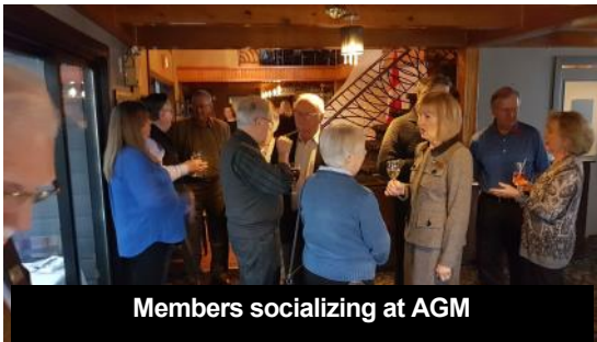
Members socializing at AGM